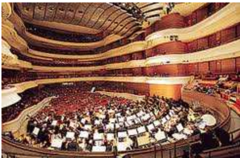
The Segerstrom Concert Hall