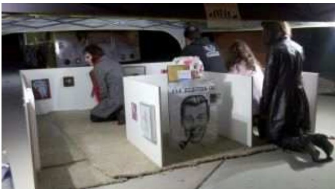
At the recent Art Crawl people literally had to crawl to see the art!!