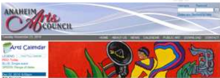
Page banner and menu bar. Quick calendar, left.

December is the month in which the Arts Council unveils its new web site. This represents a huge step forward in the way the Council presents its public image, and as a gathering place for the arts in Anaheim. The intention is to provide dynamic content with its revolutionary new calendar, arts news provided by local contributors and staff writers, and much, much more.