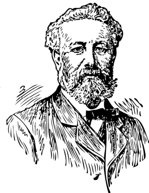
Jules Verne (Feb. 8, 1828 - Mar. 24, 1905)

Did you know? Verne published at least 1 book a year for over 40 years on a wide range of subjects. Which one was your favorite?